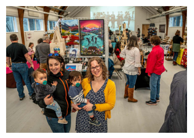
The Nave | Cook Inlet Housing Authority

NAHRO's diversity, equity and inclusion (DEI) work is an ongoing, association-wide priority. In addition to presenting sessions at all in-person NAHRO conferences, the Diversity, Equity and Inclusion Advisory Committee (DEIAC) hosts quarterly webinars on a range of topics, including Affirmatively Furthering Fair Housing, Creating a Safe Environment for Justice-Involved Returning Citizens, and more. DEIAC also formed its first LGBTQ+ Subcommittee, which hosted