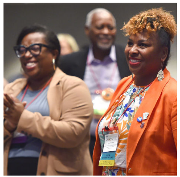
Attendees at NAHRO Conference