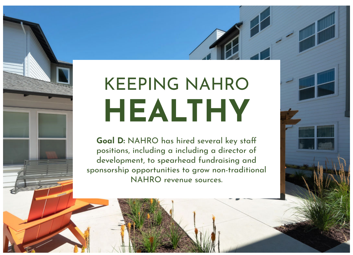
Rosefield Village | Housing Authority of the City of Alameda

Thanks to the tireless efforts of the Budget and Administration Committee and NAHRO staff, the association continues to be financially healthy and stable. Membership dues are the primary source of NAHRO's revenue — after all, an association is only as healthy as its member base. NAHRO's membership numbers continue to hold strong, with more than 96% of NAHRO members renewing their memberships in 2022. NAHRO's Professional Development & Certification revenue continues to be strong, and has exceeded budget forecasts in both 2022 and 2023.