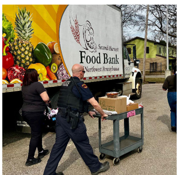
Feeding Our Families | Housing Authority of the City of Erie