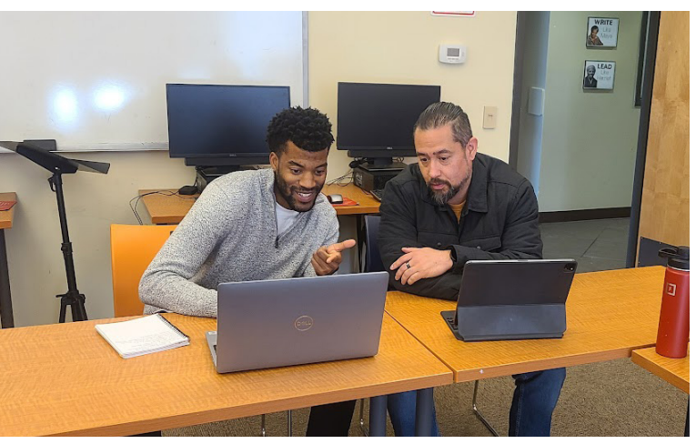
Financial Coaching | Denver Housing Authority